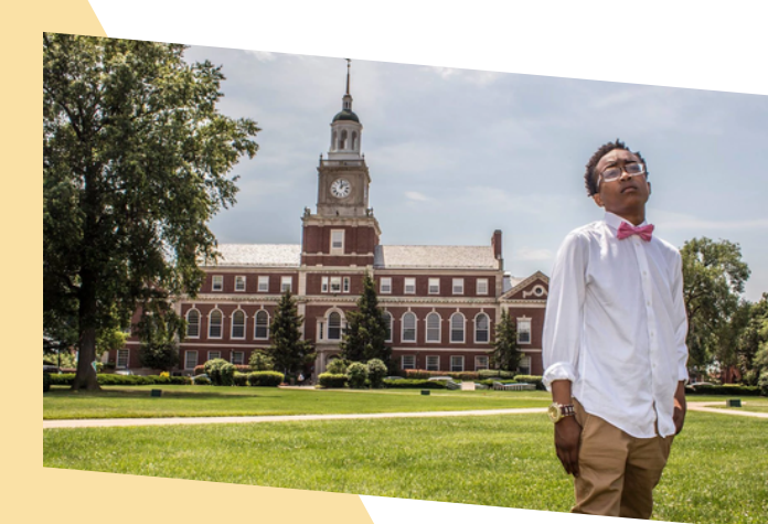
The young men receive hands-on experiences to open their minds to varying career paths and post-secondary avenues for success.

Alpha Scholars mission is to prepare young males (9th-12th grade) for college and the post-secondary challenges they are sure to face. We focus on academic achievement, choosing the right college, SAT/ACT prep, finding scholarships, and best practices on the journey towards graduation.